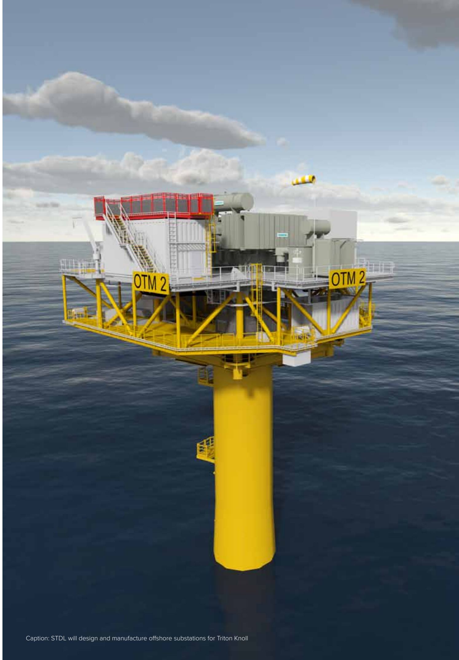
Caption: STDL will design and manufacture offshore substations for Triton Knoll