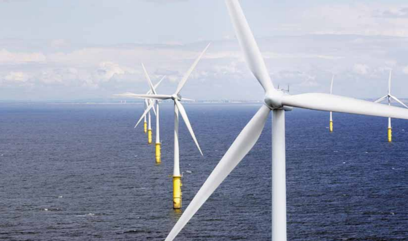
Caption: Wind turbines at sea at one of innogy's other UK offshore wind farms. Images used in this document are not intended to represent the size or scale of Triton Knoll Offshore Wind Farm, unless otherwise indicated.