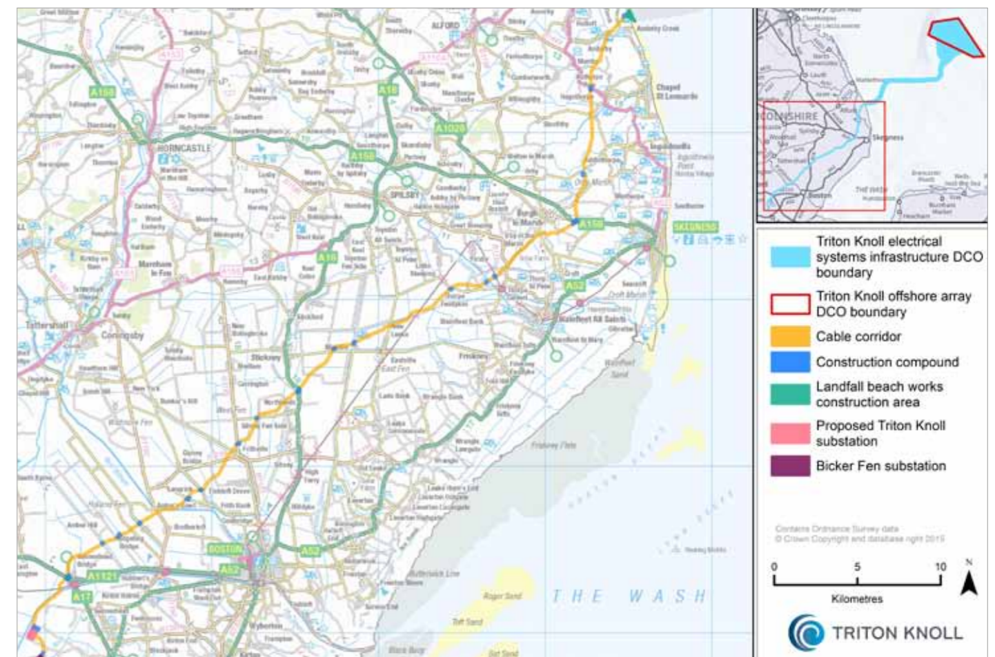
Caption: Maps shows the electrical system without the intermediate electrical compound.

This design change means that project infrastructure in the proximity of Orby is now expected to be limited to the underground cable and joint bays.